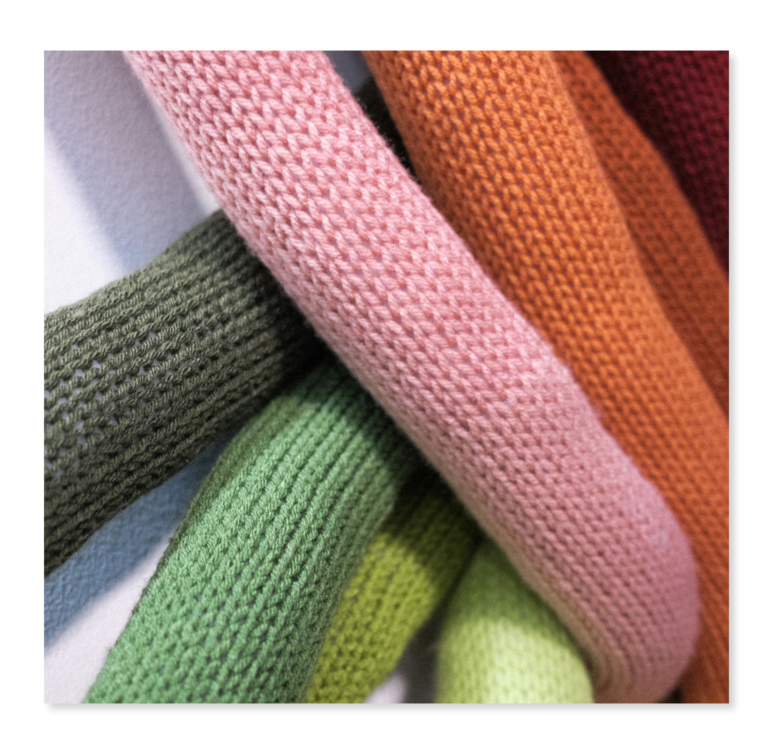
The Art of Diversity